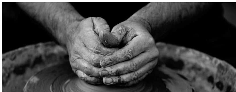
I do pottery at the weekends

You need to think about how to talk about the things you like to do and how to speak for a long time. This is where all the English question words can help you.