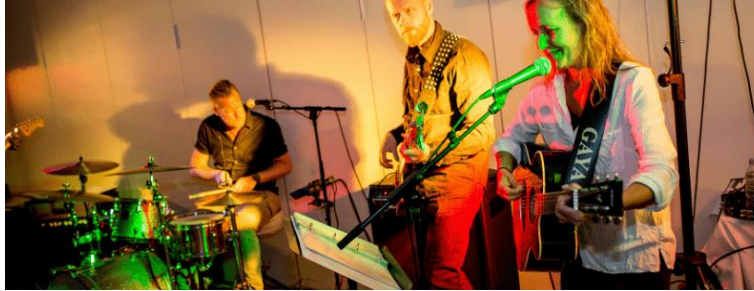
Our band played live for the first time last week

Our band played live for the first time last week. We were all really nervous, but it went pretty well. I think we were all surprised by how much the crowd liked us.