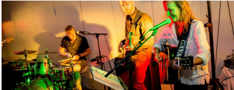
Our band played live for the first time last week

Our band played live for the first time last week. We were all really nervous, but it went pretty well. I think we were all surprised by how much the crowd liked us.